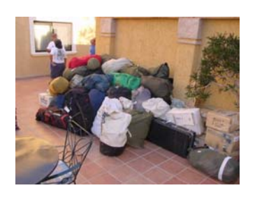
Tuesday, October 31, 2006 (Loreto, BCS, Mexico)

(Left) Unloaded equipment after picking up volunteers from the airport. (Right) Volunteer welcome and orientation meeting.