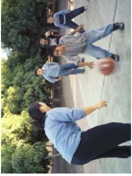
Basketball clinic in Loreto.

The dates for this trip are Sunday, October 29, to Sunday, November 5, 2006. Cost for the 7-day trip per person, double occupancy, is $755 from Los Angeles, $880 from San Francisco, and $955 from Seattle. Add $200 if rooming alone. (For other departure cities, please contact SWC for more information.) EXTEND your trip 2 days (until November 7) for only $90 extra, or 4 days (until November 9) for $180 extra!