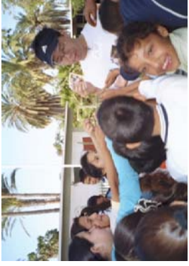
Handing out baseball cards in Loreto.

Included in the price are airfare, hotel, breakfast, all group/SWC work-related ground transportation, and SWC volunteer T-shirts. Not included are costs for extra activities. (A separate form for extra activities will be sent at a later date.) Some of this trip is tax-deductible, please consult your personal tax advisor. Accounting for all expenses will be provided to each volunteer at the end of the trip and all unused monies will be reimbursed.